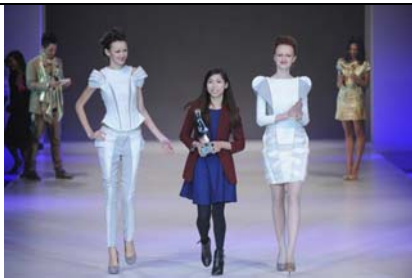
Photo Download: http://filesharing.tdc.org.hk/hktcd/download.php?fid=_phpSunCCO

The designer’s passion for diving and dancing inspired this collection. A novelty material for party wear, neoprene can create striking shapes, especially when mixed with soft chiffon. The resulting outfits are figure-hugging and exaggerated. The black and fluorescent-yellow colours create strong contrast.