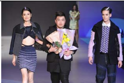
Photo Download: http://filesharing.tdc.org.hk/hktcd/download.php?fid=_phpweDjfv

The Egyptian mummy and Gothic cathedral, symbols of spirituality and rebirth, provided the inspiration for this collection. The designer sewed strips of cloth onto fabric to create geometric patterns. The overall silhouette is neat and structured.