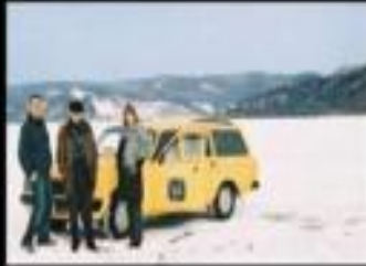
Where people think we live