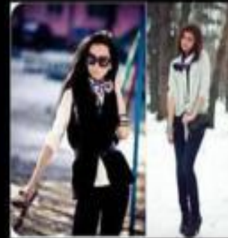
What we actually wear