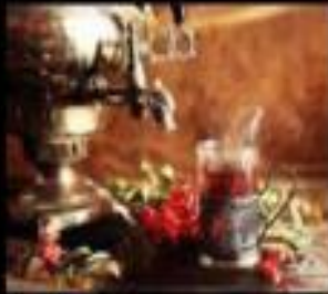
What we actually drink