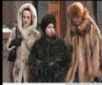
What they think we wear