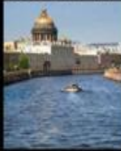
Where we actually live