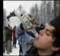
What they think we drink